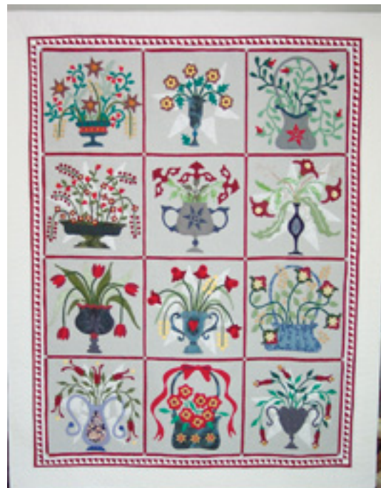
This quilt is my version of the first "The Quilt Show" Block of the Month.