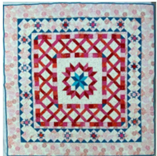
The Contemporary Raffle Quilt for 2022

Continuing exhibits include "Inspired by Endangered Species." And, a member of the Alexandria Chapter of Quilters Unlimited has donated a beautiful 66"x66" quilt as the 2022 Contemporary Raffle Quilt. Tickets are available for $1.00 each with the drawing to be held on Saturday, December 10.